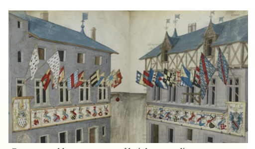
Banners and large pennons of knights attending a tournament, flying from the windows of their hotel rooms. From King Rene's Tournament Book f33v-34r, 15th century.

At this larger size, and especially when paired with a banner (which marks the location of the individual noble), these larger pennons function solely as rallying point for the noble's forces. The larger pennon thus becomes func-