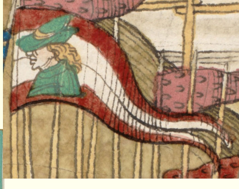
Swallow-tailed pennon, from Spiezer Schilling, BBB Mss.hh. 10016, 1480s Germany

Depictions of swallow-tailed pennons vary, with the split ranging from a thin slit to a wide cut-out, and running from less than a quarter to more than half the length of the fly.