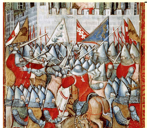
From l'Entree d'Espagne, 1398, Italy

The pavons above are all pennoncels, identifiable because they are almost twice as tall as they are wide; lance-pennons in the pavon style tended to be equally tall and wide, as seen below.