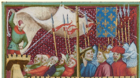
Red pennoncelles with white crosses, from Grandes Chroniques de France, Français 2608 f331r, 1390s France

they are tall, while pennoncelles are generally much longer relative to their height.