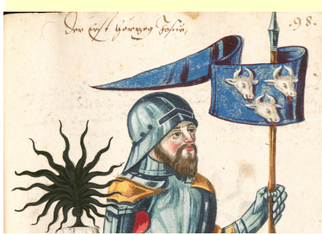
Pennon, Azure, three cow's heads argent, from Wappenbuch - BSB Cgm 9210, 1602 Germany

This article is the third in a series covering the various types of heraldic flags found in the Middle Ages, providing enough of an overview to their use to inspire the reader to design and paint their own. Each article will describe the distinguishing features of the flag type, including their typical use in period, using examples from period art where available. At the end of the article, I will guide the reader through the process of designing a new flag using armory appropriate both to the SCA and history. This article covers an incredibly versatile heraldic flag: The pennon.