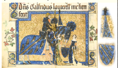
Portrait of Geoffrey Luttrell and family, with details. From the Luttrell Psalter, 202v, c. 1330

The pavons above are all pennoncels, identifiable because they are almost twice as tall as they are wide; lance-pennons in the pavon style tended to be equally tall and wide, as seen below.