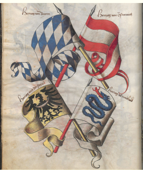
Pennons in the arms of Bavaria, Austria, Silesia, and Milan. From Wappenbuch von Grünenberg, 1480s Germany

The underlying principle of sumptuary laws, as succinctly expressed by Zero Mostel, is "When you've got it, flaunt it!" As bachelor knights served under bannerets, bannerets in turn served under Nobility and Royalty, who required a bigger and more impressive flag than a banner to focus their forces. The solution? Larger pennons!