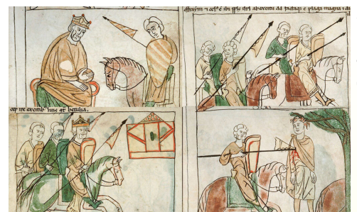
Scenes from the Navarre Picture Bible, Amiens – BM – ms._0108, 1198 Pamplona, Spain