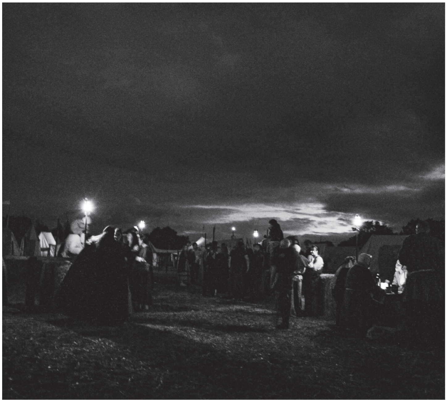
Lights in the dark

Official Newsletter of the Kingdom of Drachenwald