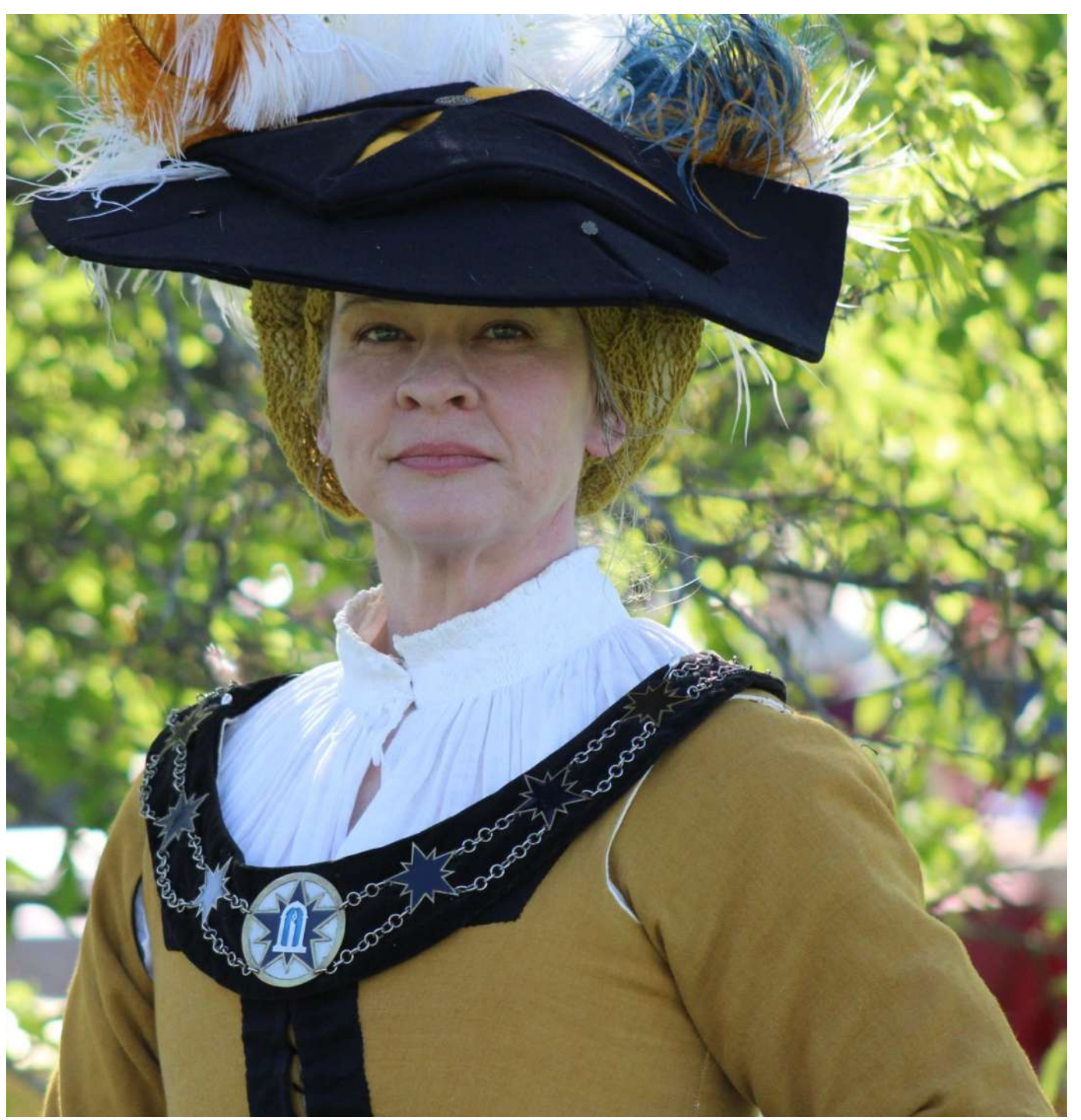
The official newsletter for and by the Kingdom of Ansteorra Volume 60, Issue 6 Anno Societatis LVIII