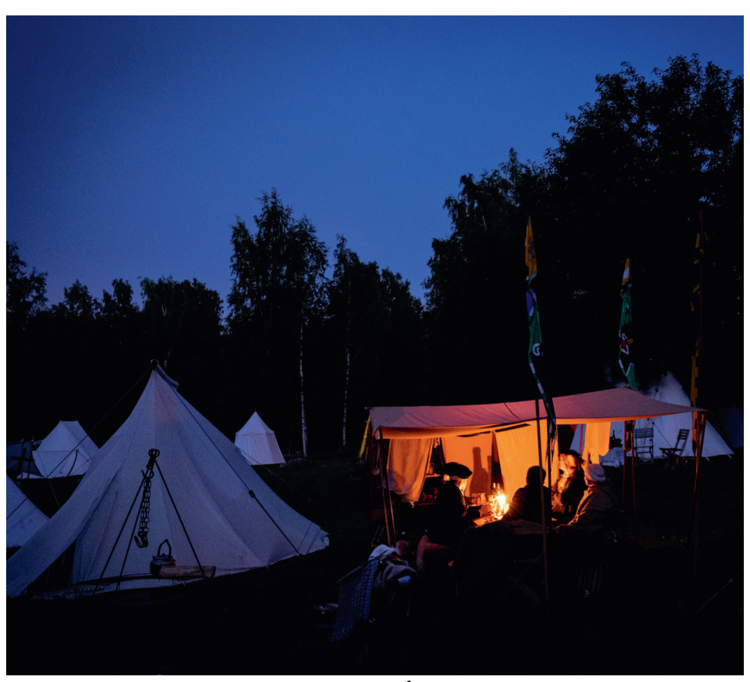
Long Summer Nights await us

Official Newsletter of the Kingdom of Drachenwald