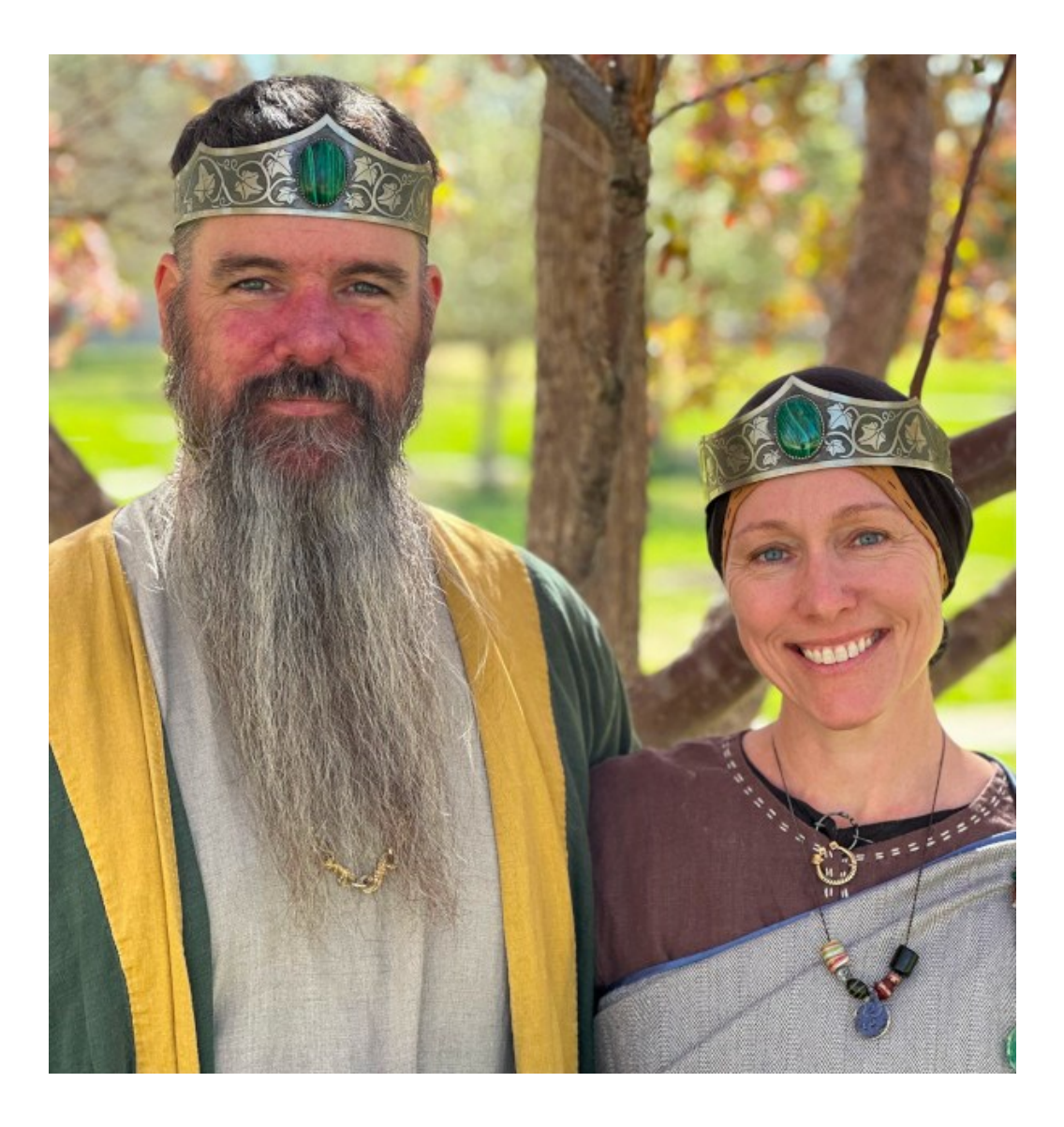
Their Royal Highnesses Mordygan and Ymanie Dread Lord and Lady of All Argonia

The Official Newsletter of the Kingdom of the Outlands