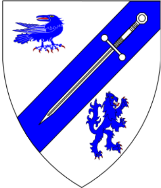
AIDEN AP GRENDAI KING OF AVACAL