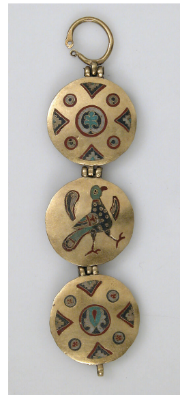
CHAIN WITH BIRDS AND GEOMETRIC MOTIFS. 1000-1200 CA KYIV (PROBABLY), UKRAINE MET MUSEUM (NY)