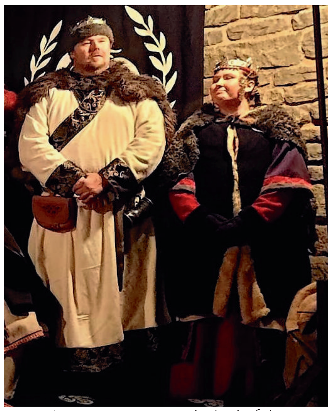
A new power emerges ... in Styringheim

Official Newsletter of the Kingdom of Drachenwald