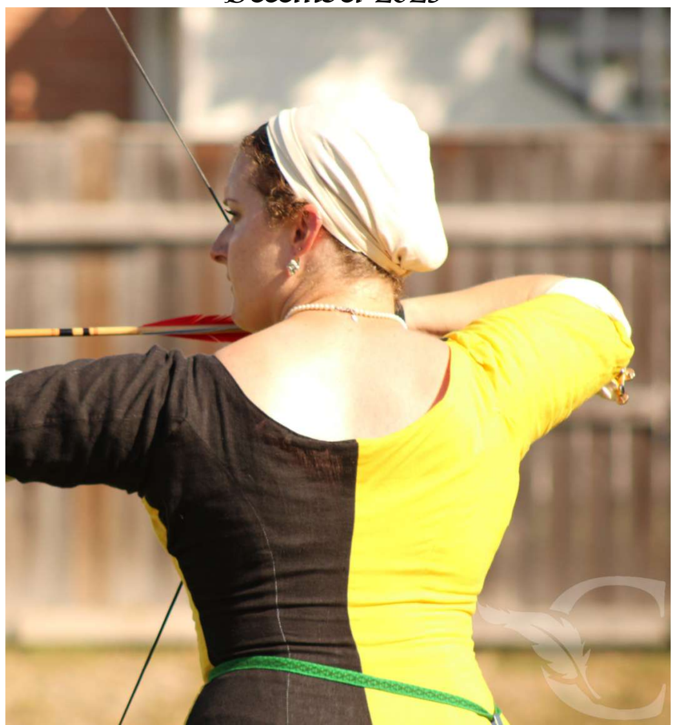
The official newsletter for and by the Kingdom of Ansteorra Volume 60, Issue 12 Anno Societatis LVIII