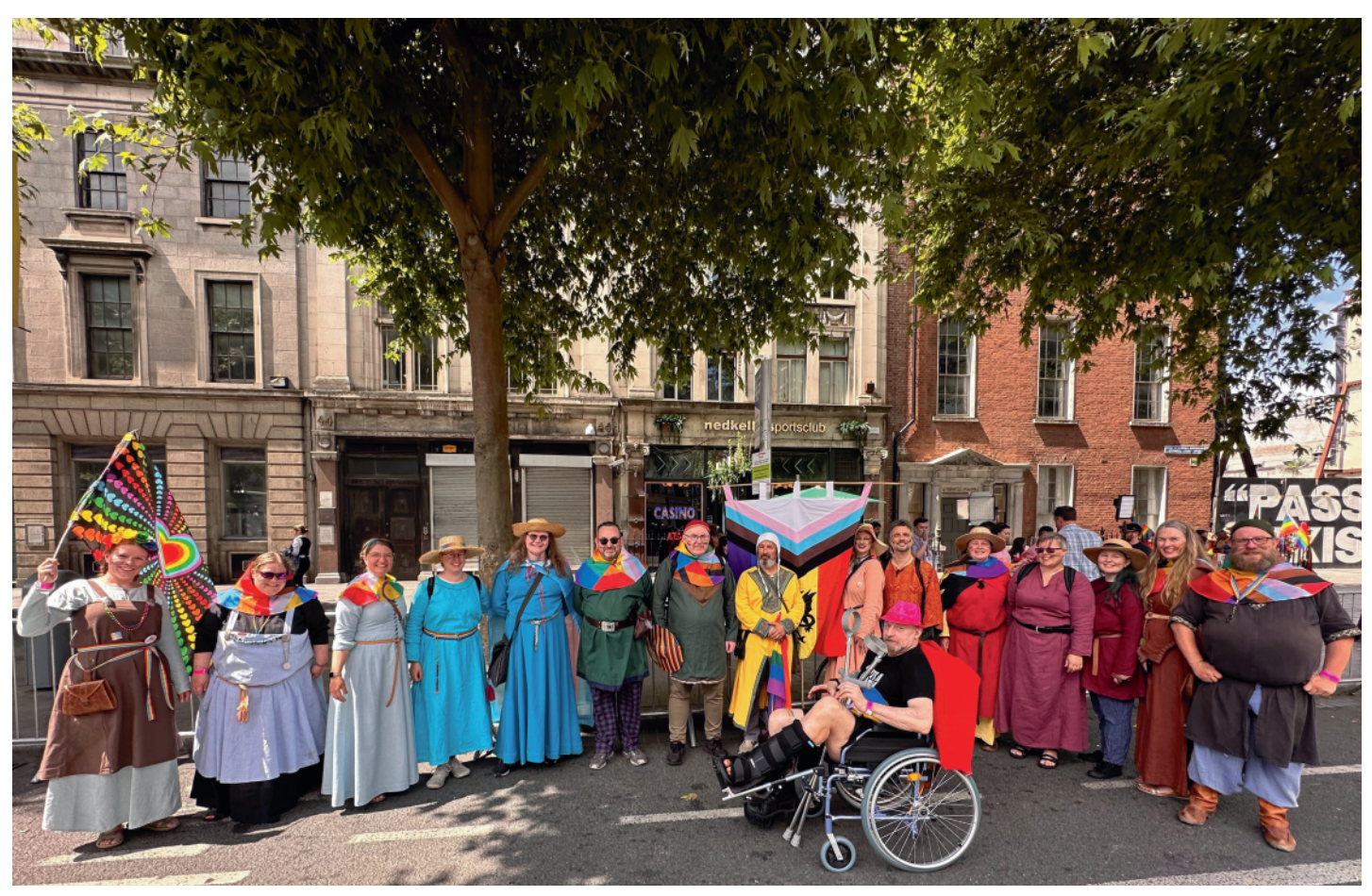
Drachenwald - All the colors of the rainbow

Official Newsletter of the Kingdom of Drachenwald