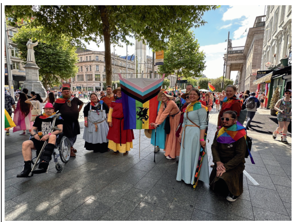
Drachenwald on the streets of Dublin Pride