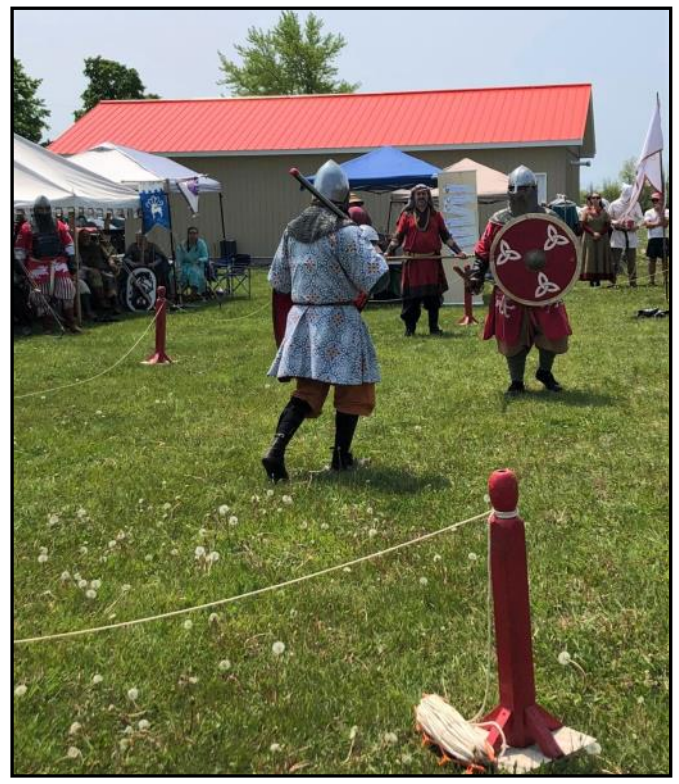
The Tidings - Ealdormere's Official Newsletter Page 4