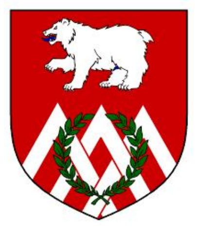
Ealdormere - We Wear the Scarlett Proudly