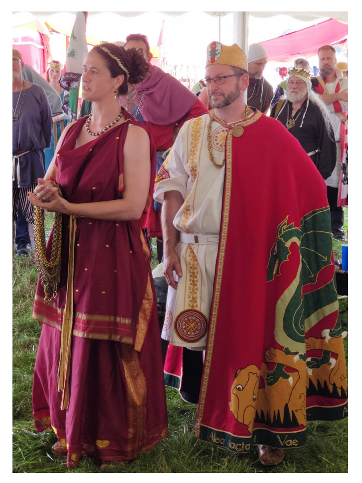
Their Majesties at Pennsic 50.