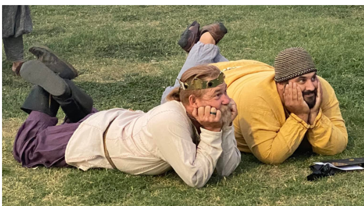
Photo Credit: "Court" by Mistress Magdalen Venturosa OP (Monique Berry Lyon)