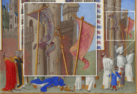
Detail from the Très Riches Heures du Duc de Berry, f72r, 15th century France.

stantine the Great, when the chi-rho was added to the top of the upright pole and portraits of the Imperial family were added to the flag itself. This form of the vexillum was known as the labarum. In time, these portraits would give way to depictions of the same chi-rho Christogram, crosses, and other religious iconography.