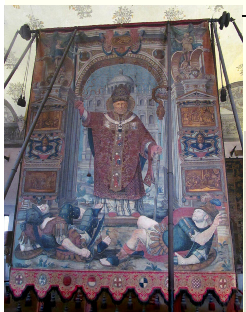
Gonfalon of Milan. 1567 Italy

Even when gonfalons focused primarily on religious imagery, heraldic elements frequently graced the periphery of the design. Below is a large 16th century embroidered and painted gonfalon from Milan depicting Saint Ambrose. Several cartouche-shaped shields adorn the bottom of the gonfalon.