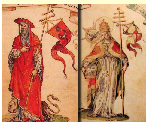
Swallow-tailed gonfalons from the Korjenić-Neorić Armorial, 1595 Southeast Europe

Generally, gonfalons have a square main body with at least two dags (swallowtailed) but more frequently have three dags with squared ends, as seen in the examples above.