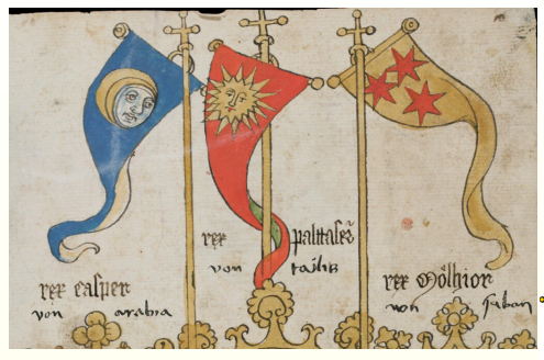
Three gonfalons, from St. Gallen, Stiftsbibliothek, Cod. Sang 1084, p. 16, 1480s Germany

Flat-bottomed gonfalons, following the model of the vexillum, are seen most typically in non-heraldic gonfalons, but there are examples of heraldic versions as well, particularly with "trumpet banners," or gonfalons mounted to straight trumpets.