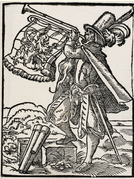
A bugler with a rectangular gonfalon. From Jost Amman's Das Ständebuch, 1586 Frankfurt

Flat-bottomed gonfalons, following the model of the vexillum, are seen most typically in non-heraldic gonfalons, but there are examples of heraldic versions as well, particularly with "trumpet banners," or gonfalons mounted to straight trumpets.