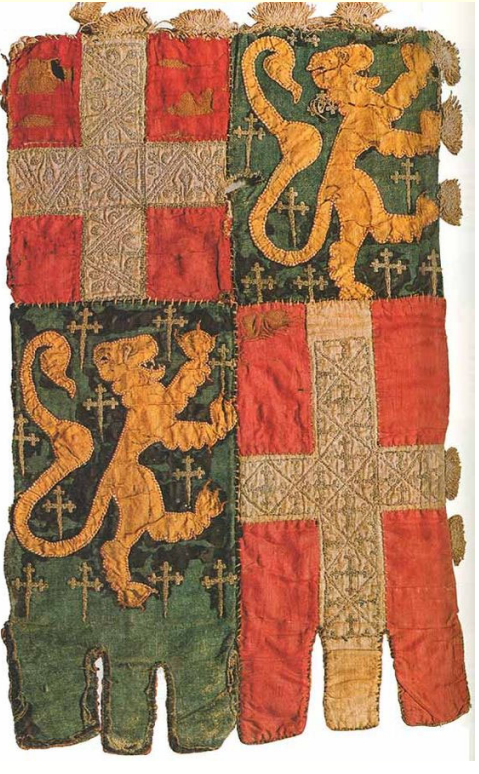
14th century gonfalon, from Blonay Castle, Switzerland

Of the few extant heraldic flags from the Middle Ages, one of the more sumptuous examples is the 14th century Swiss gonfalon, below. The