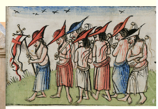
Flagellants processing behind a gonfalon. From the Chronicle of Konstanz. Cod. Sang 646, f50r, 1460s

form among the clergy generally, we do have examples of gonfalons being used primarily to display heraldry. The first example below is from a roll of arms that routinely displays a shield with the cross of Saint George alongside other shields.