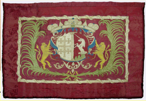
16th century embroidered gonfalon. From the collection of the Metropolitan Museum of Art

Here's an example of a rectangular gonfalon (likely for a trumpet) that displays a full achievement.