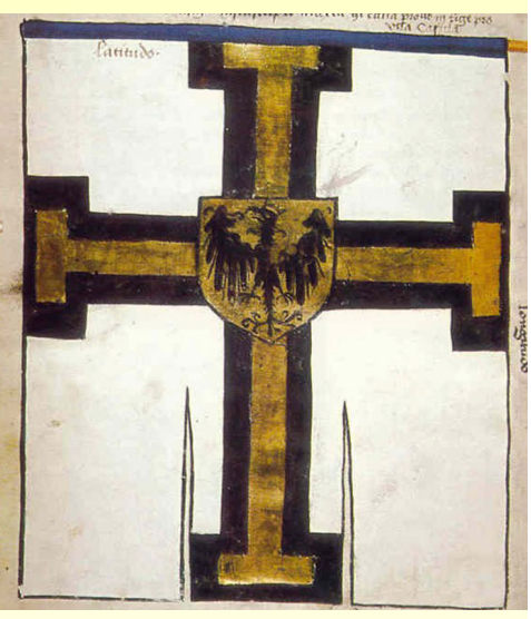
Gonfalon of Grand Master Vericus de Junigen. From Banderia Prutenorum, 1410, Poland

Below is another depiction of a gonfalon in the arms of the Grand Master of the Teutonic Order, this time in a catalog of captured flags from 1410.