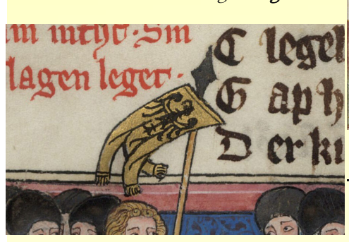
Gonfalon from the Willehalm Codex, 2° Ms. poet. et roman. 12v, 1334 Germany

This article marks the fourth in a series of articles covering the various types of heraldic flags found in the Middle Ages, providing enough of an overview to their use to inspire the reader to design and paint their own. Each article will describe the distinguishing features of the flag type, including their typical use in period, using examples from period art where available. At the end of the article, I will guide the reader through the process of designing a new flag using armory appropriate both to the SCA and history. We continue this series with one of the earliest heraldic flags: The gonfalon.