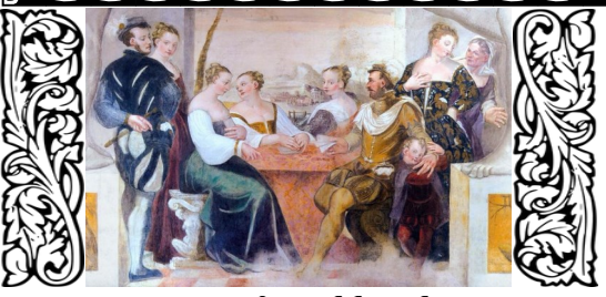
Known World Italian Symposium - Virtual August 19, 2023

Directions: From 395 coming from Reno: Take Exit 78 for Red Rock Blvd. Follow Red Rock for approx 20 miles before turning onto Quarterhorse Circle. Destination is on the left.