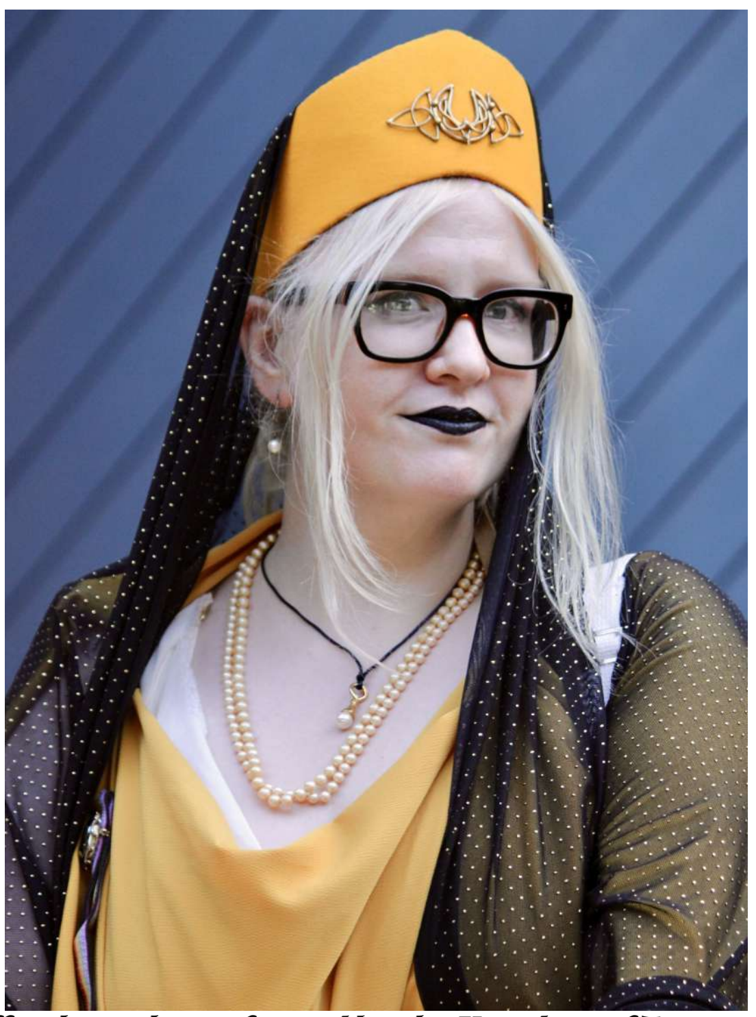
The official newsletter for and by the Kingdom of Ansteorra Volume 60, Issue 10 Anno Societatis LVIII