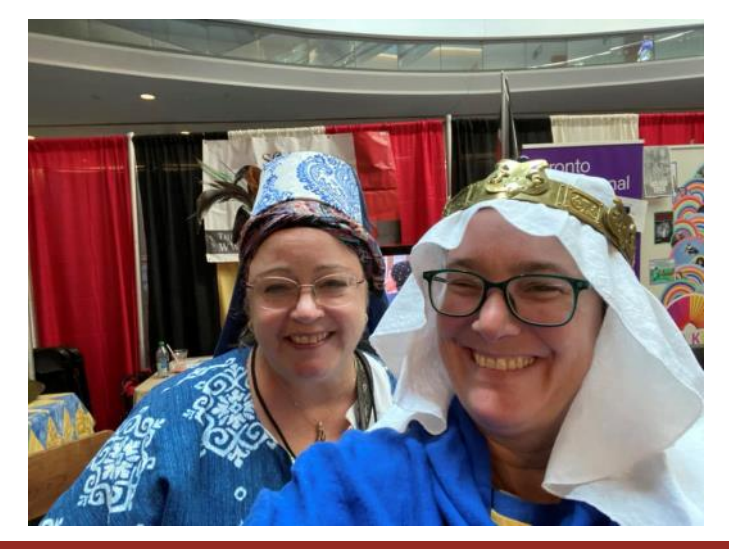
Ealdormere - We Wear the Scarlett Proudly Page 13