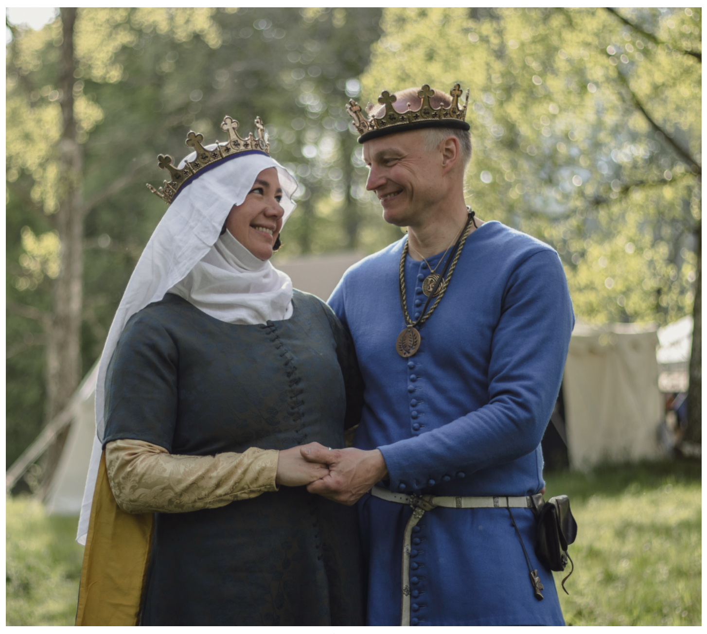
Drachenwald - Past & Future

Official Newsletter of the Kingdom of Drachenwald