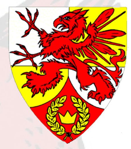
EYODDI LOKADOTTIR QUEEN