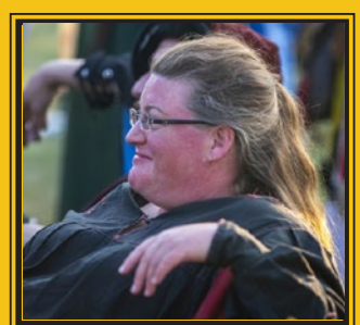
CASTRA D'OR ORDER OF DEFENSE CADET TO: Don Bjar the Blue, OP ELEVATION & VIGIL: Fall Crown VIGIL ORGANIZING: Don Bjar the Blue, OP