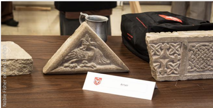
Noble Fisher of Ben Dumfirth