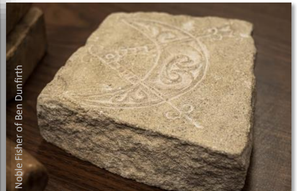
Noble Fisher of Ben Dumfirth