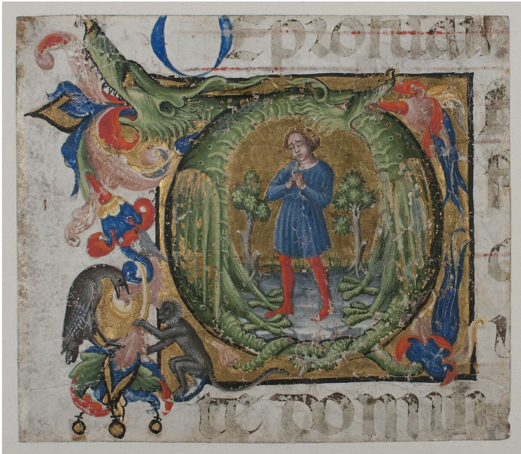
Manuscript Illumination with Initial Q, from a Choir Book

The Official Newsletter of the Kingdom of the Outlands