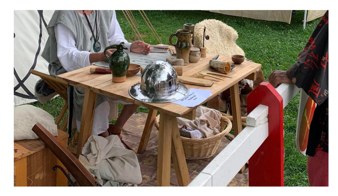
Goods from a 13th century life at the Crafter's Green at Pennsic 50 - photographed by Countess Serena Kimbalwyke (Sheri Israel).