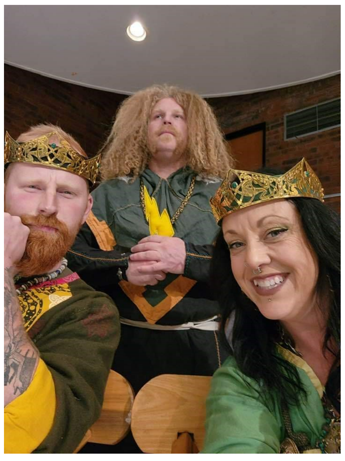
The Official Newsletter of the Kingdom of the Outlands