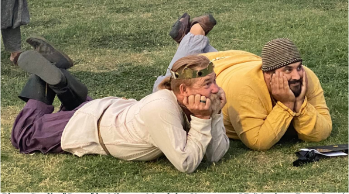
Photo Credit: "Court" by Mistress Magdalen Venturosa OP (Monique Berry Lyon)