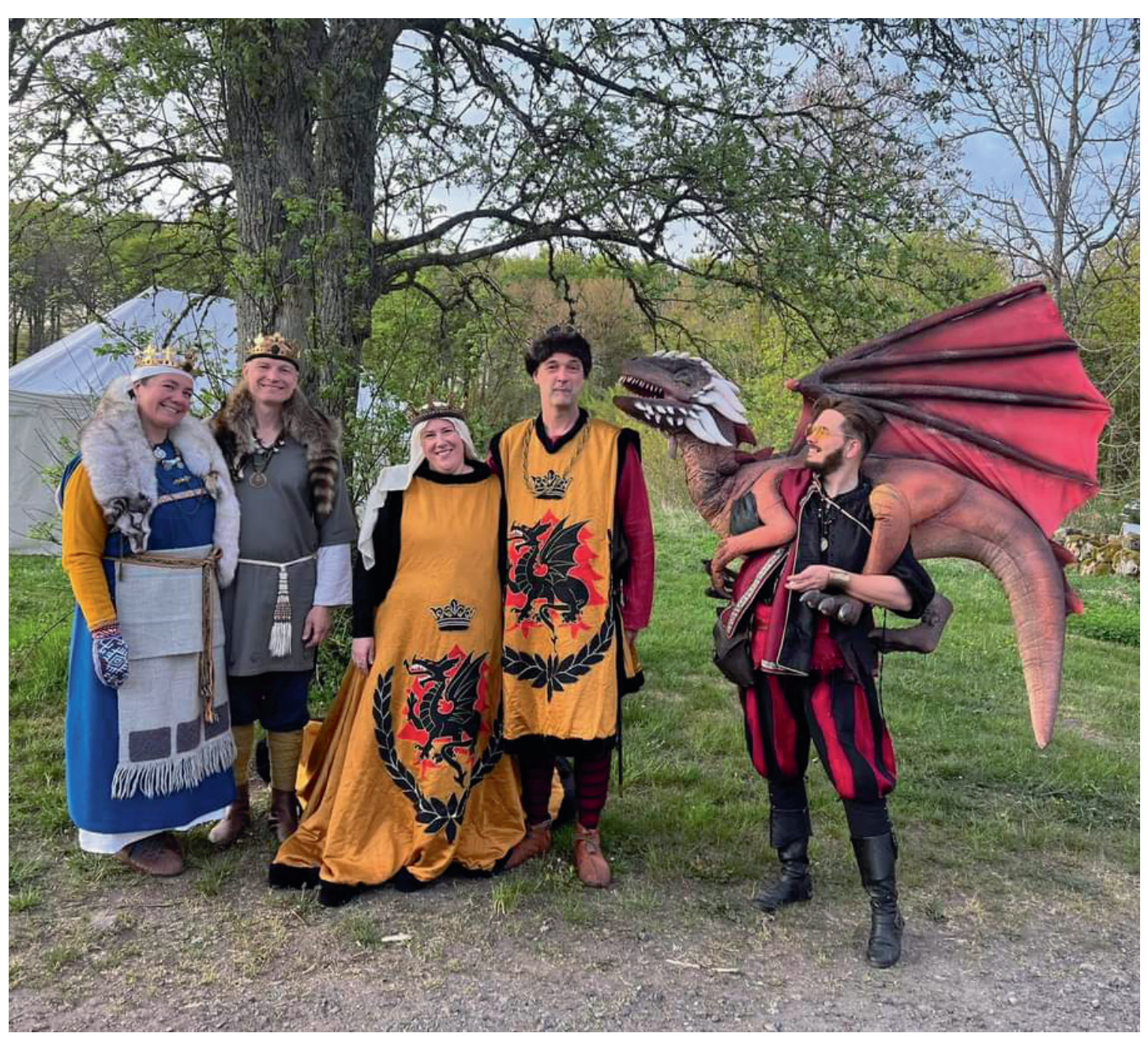
A dragon in Drachenwald ...

Official Newsletter of the Kingdom of Drachenwald