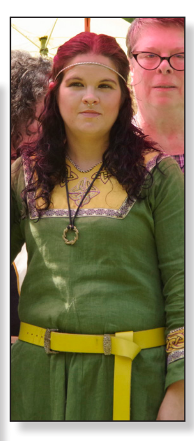
Page 12 • The Ambassador • August 2023