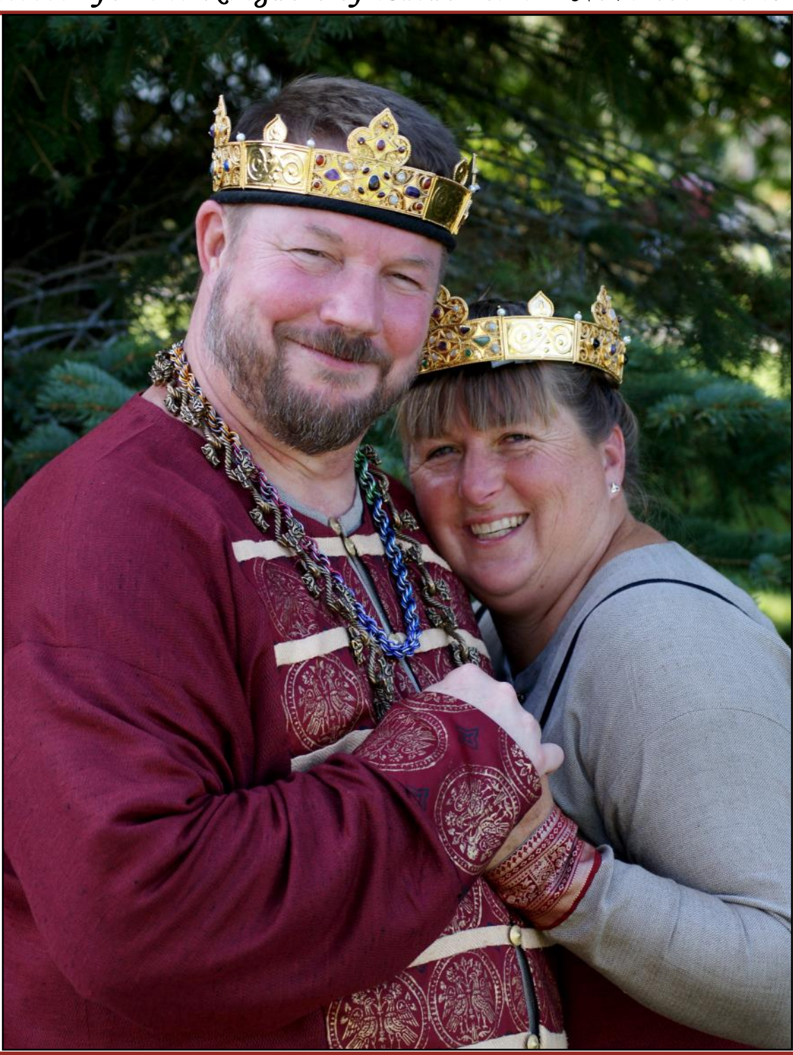
Anno Societatis LVIII